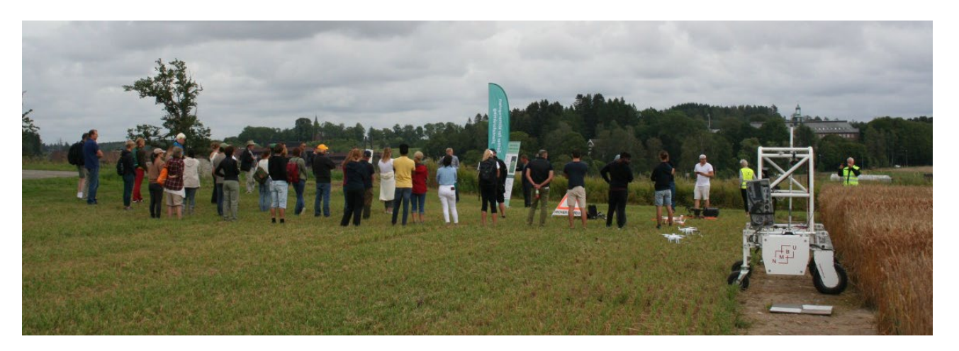
Programme - NPPN Field day, 19 June 2023 Hosted by the Norwegian University of Life Sciences (NMBU) and Graminor